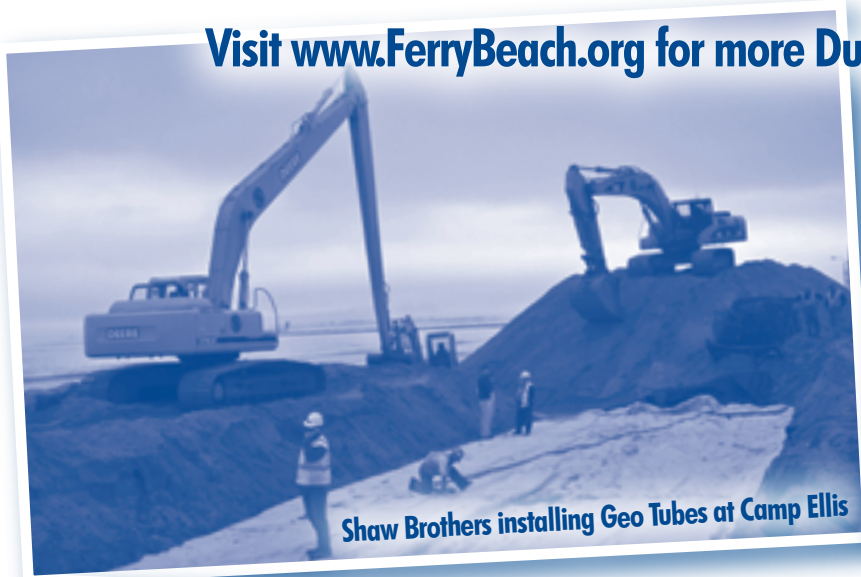
Shaw Brothers installing Geo Tubes at Camp Ellis

Visit www.FerryBeach.org for more Dunes Restoration Photos!