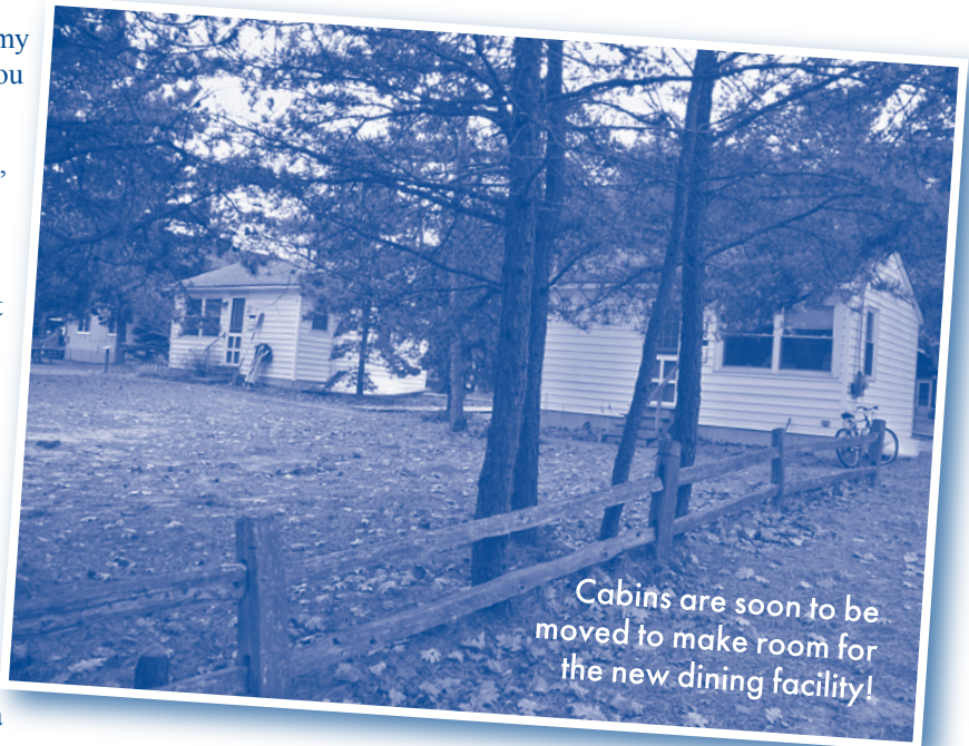
Cabins are soon to be moved to make room for the new dining facility!